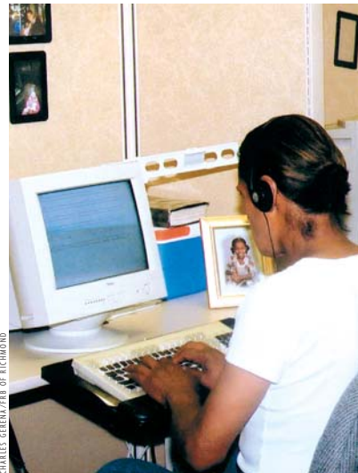
To encourage productivity, this recovering addict in Baltimore receives bonus pay for completing data entry drills.

The work therapy program at Triangle Residential Options for Sub-