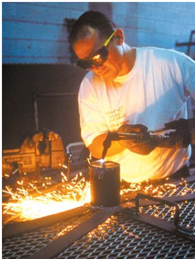
At TROSA in Durham, N.C., drug addicts learn a trade as part of their recovery.

learned, so you can get by with less than a full brain.”