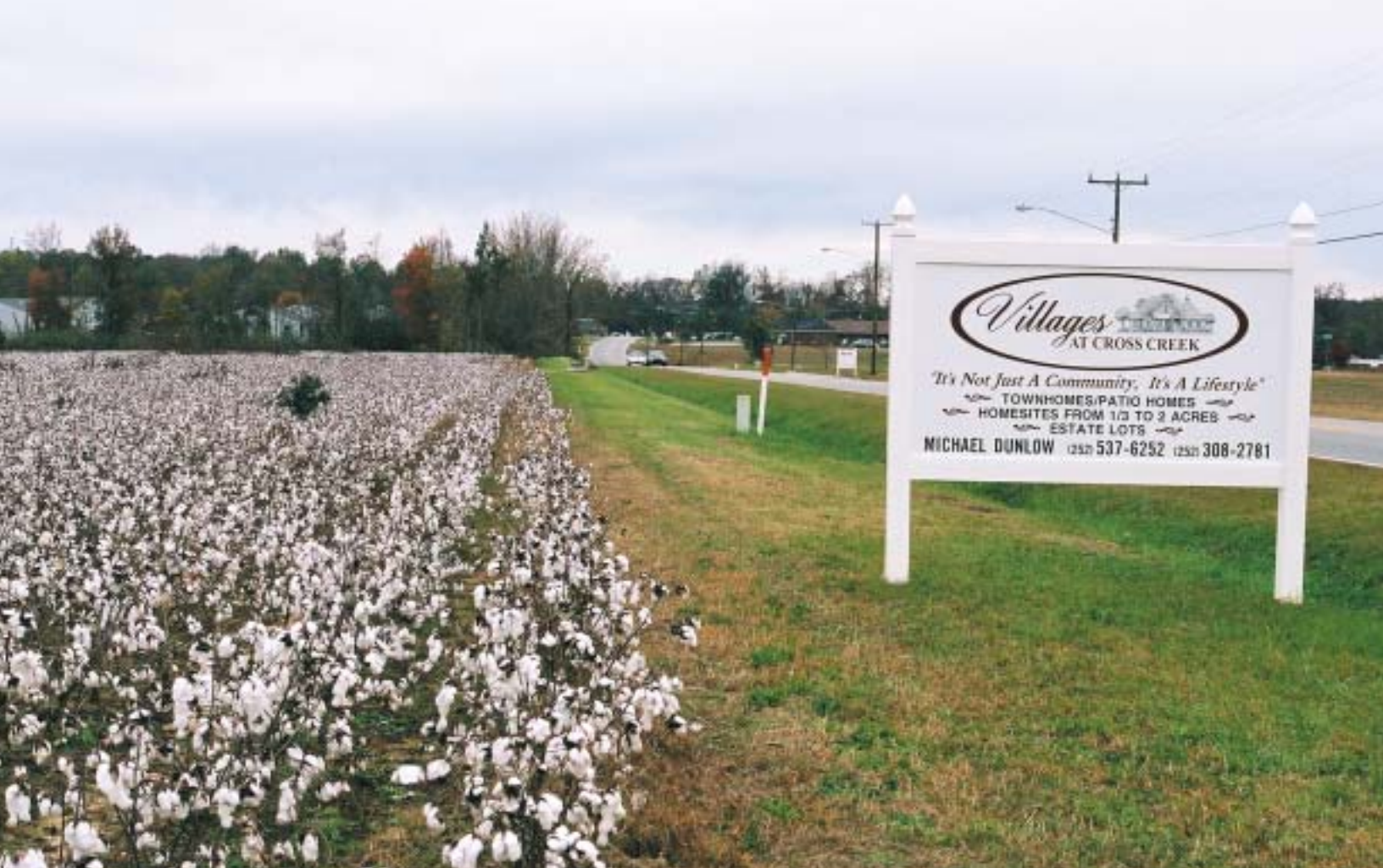
Cotton fields are giving way to development as commercial and residential communities pop up along Interstate 95 in Roanoke Rapids and Halifax County.