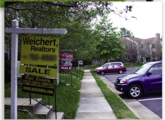
Multiple adjacent homes await buyers in this Fairfax, Va., neighborhood.

is effectively selling the house to the lender.