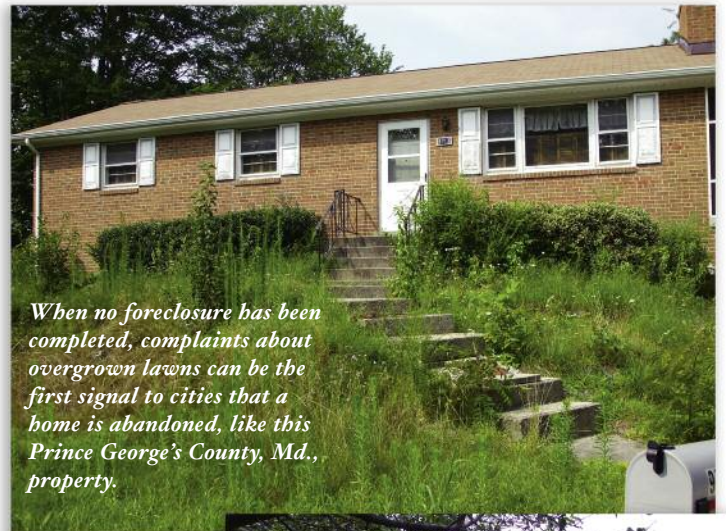
When no foreclosure has been completed, complaints about overgrown lawns can be the first signal to cities that a home is abandoned, like this Prince George's County, Md., property.

When economists think about a homeowner's decision to default on a mortgage, they borrow from what is called "option price theory." An option is a security that entitles the owner to buy or sell an asset in the future at a predetermined price. A "put" option is useful when one expects the price of the underlying asset to decrease: The holder can sell it for a higher price than one would be able to get on the market. A homeowner's ability to default on a mortgage is like a put option when the home's value is falling, since one