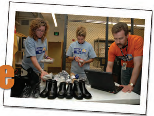
United Way volunteers sort shoes at a shelter. The organization and others like it are categorized as public-society benefit groups.

Money trouble finally forced Charleston, S.C., Symphony Orchestra to suspend its 2009-2010 season. Over in Charleston, W.Va., a foundation announced it's running out of money. It will fold this fall after disbursing its $9 million remaining dollars. The Clay Foundation had granted $100 million over its 23-year history.