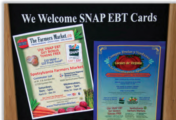
Many farmers markets now accept electronic payments. Markets in Spotsylvania County, Va., even offer a bonus match for those using their food assistance benefit cards.

Some markets charge customers for credit or debit sales to cover various transaction fees. But the West Asheville market instead assesses vendors $2 per week in